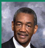
Osby Davis, Mayor, City of Vallejo