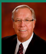
Jack Batchelor, Jr., Mayor, City of Dixon