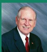
Len Augustine, Mayor, City of Vacaville