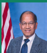
Pete Sanchez, Mayor, City of Suisun City